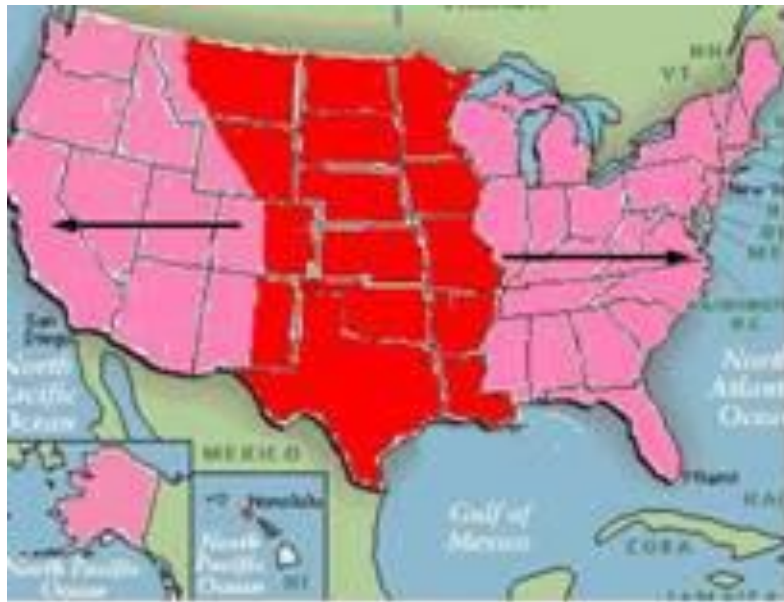
Coyote dispersal range

Coyotes are originally native to California and several other western states. Due to their intelligence, adaptability, the decline of larger animals and urban sprawl, coyotes have successfully expanded their range. They are now found in all states except Hawaii and have successfully established themselves in every urban ecosystem across North America.