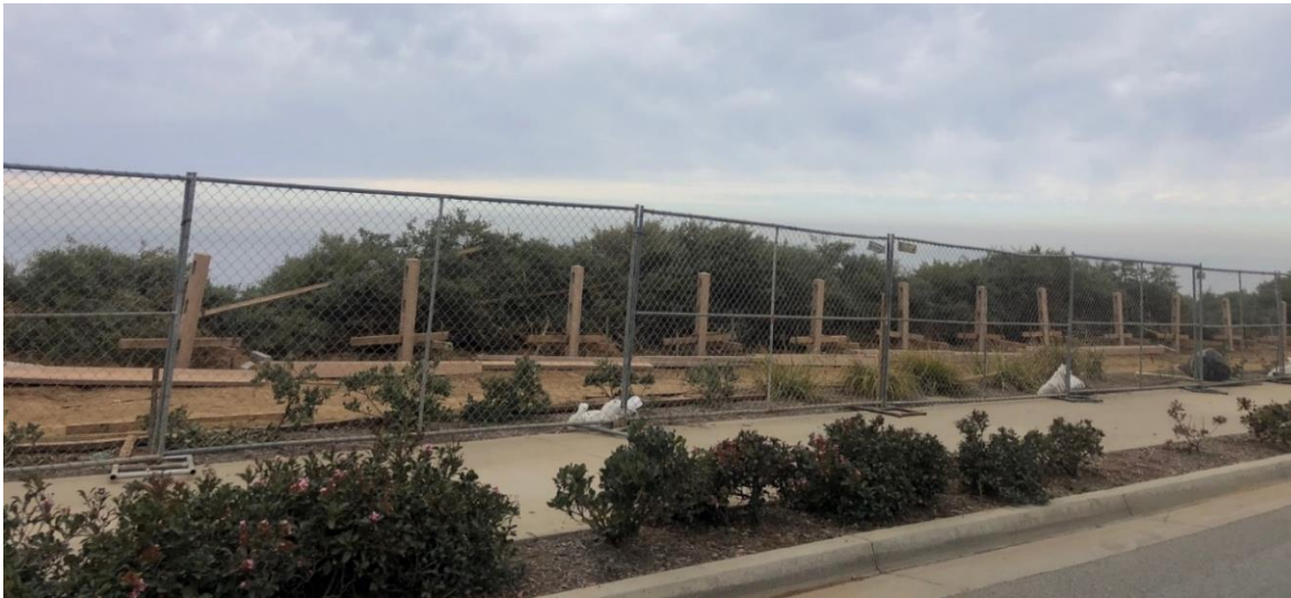
Fence replacement In Process

Phase III of the project, which consists of replacing deteriorated metal fencing along the sidewalk and trail adjacent to Calle Entradero with new fencing, is approximately 80% complete and on track for completion in mid-to late December. A section of the trail remains closed during the work (see map), and we apologize for any inconvenience due to this temporary closure.