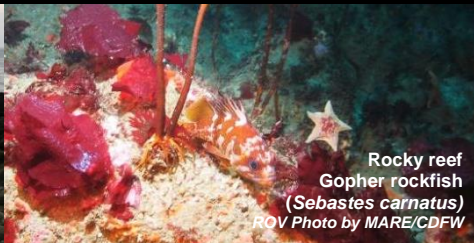
Rocky reef Gopher rockfish ( Sebastes carnatus ) ROV Photo by MARE/CDFW