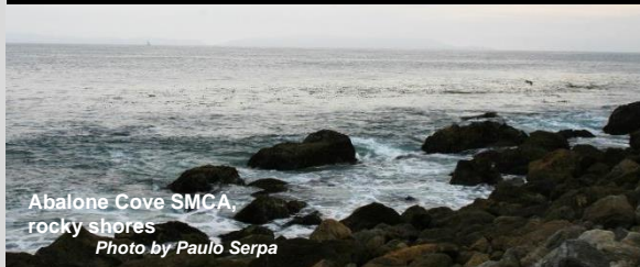
Abalone Cove SMCA, rocky shores

Southern California Marine Protected Areas (MPAs), Established January 2012