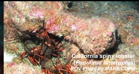
California spiny lobster ( Panulirus interruptus ) ROV Photo by MARE/CDFW