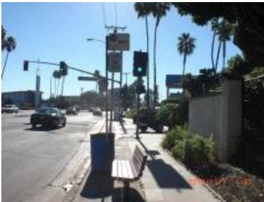
Location: Western Ave./ Caddington Dr. (SB) Photo # 25