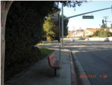
Location: Western Ave./ Toscanini Dr. (NB) Photo # 15