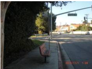
Location: Western Ave./ Toscanini Dr. (NB) Photo # 15