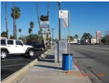
Location: Western Ave./ Park Western Dr. (SB) Photo # 34