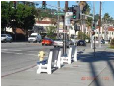
Location: Western Ave./ Caddington Dr. (NB) Photo # 22