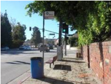
Location: Western Ave./ Toscanini Dr. (SB) Photo # 19