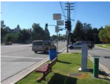
Location: Western Ave./ Ave. Aprenda (SB) Photo # 7