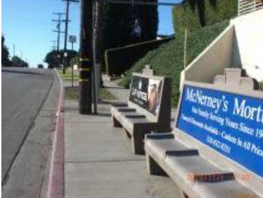
Location: Western Ave./ Summerland Ave. (SB) Photo # 40