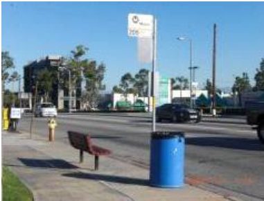
Location: Western Ave./ Trudie Dr. (SB) Photo # 28