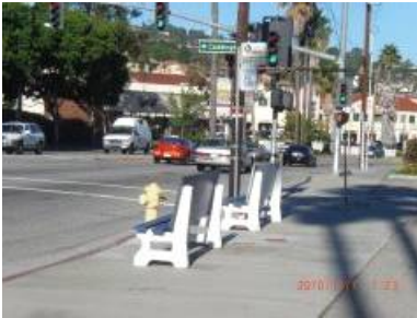
Location: Western Ave./ Caddington Dr. (NB) Photo # 22