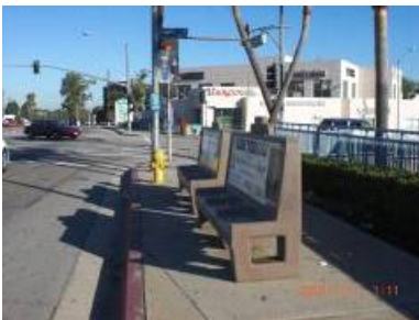
Location: Western Ave./ Capitol Dr. (NB) Photo # 31