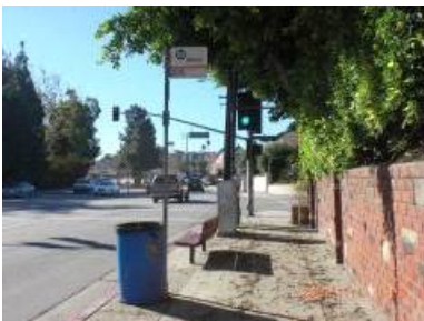
Location: Western Ave./ Toscanini Dr. (SB) Photo # 19