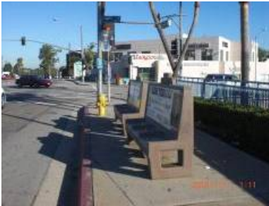
Location: Western Ave./ Capitol Dr. (NB) Photo # 31