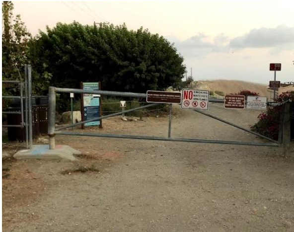
Old Burma Gate