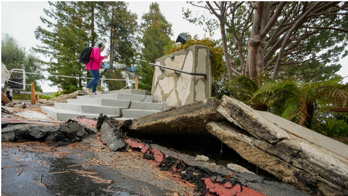
(Source: LA Times – Significant, ongoing landslide damage has necessitated the de-construction and off-site storage of the historic landmark, Wayfarers Chapel, until a new location can be found.)