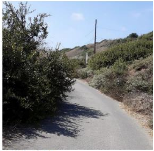
Before and after trimming on Beach School Trail.

On September 5, Staff cleared debris obstructing regulatory signage on Sea Dahlia Trail.