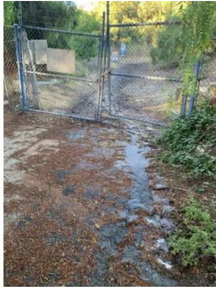
Gary's Gulch Trailhead with water running down the trail.

On August 29, a water leak near Gary's Gulch Trail and Vanderlip Trail was confirmed. This area had already been temporarily closed off to the public as repairs are needed to Vanderlip Trail prior to reopening. CalWater was notified of the incident.