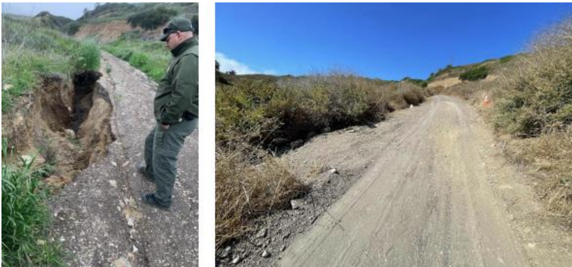
Before / After repairs of Peppertree Trail looking up toward Burma Road Trail

On August 14, a contractor completed work to repair the lower section of Peppertree Trail. This trail had been temporarily closed due to severe rutting caused during significant rain events over the course of January – March 2023. The section of Peppertree Trail from Sandbox Trail to the upper junction of Ishibashi Farm Trail is now open. Additionally, the pedestrian-only section of Ishibashi Farm Trail that had been temporarily closed is now open.