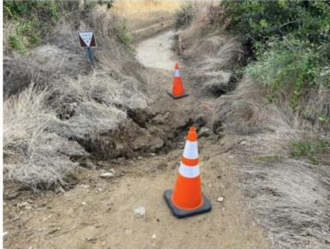
Before repairs of Toyon Trail and Burma Road Trail junction

On August 21, Toyon trailhead (by Burma Road Trail junction) sustained some damage from the recent rain. Rock and dirt were used to make repairs to ensure the trailhead remained opened.