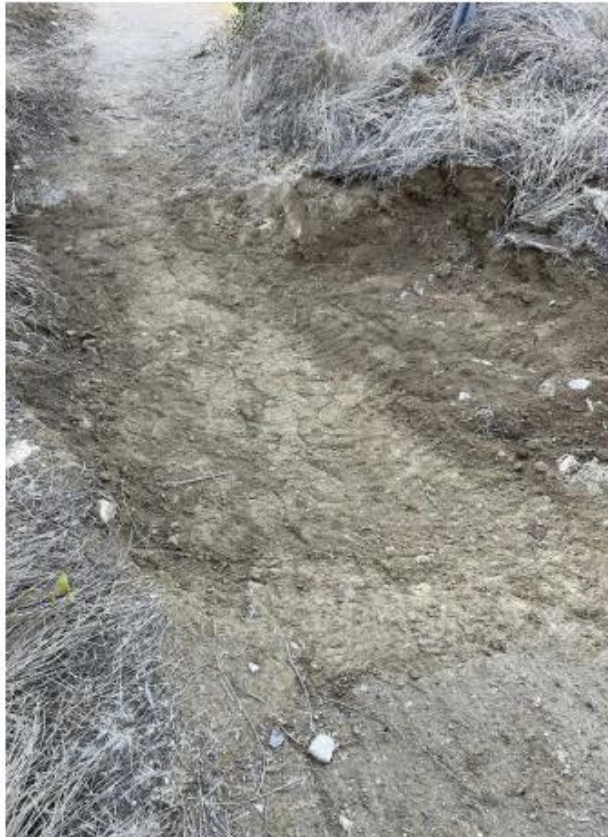
After repairs of Toyon Trail and Burma Road Trail junction.