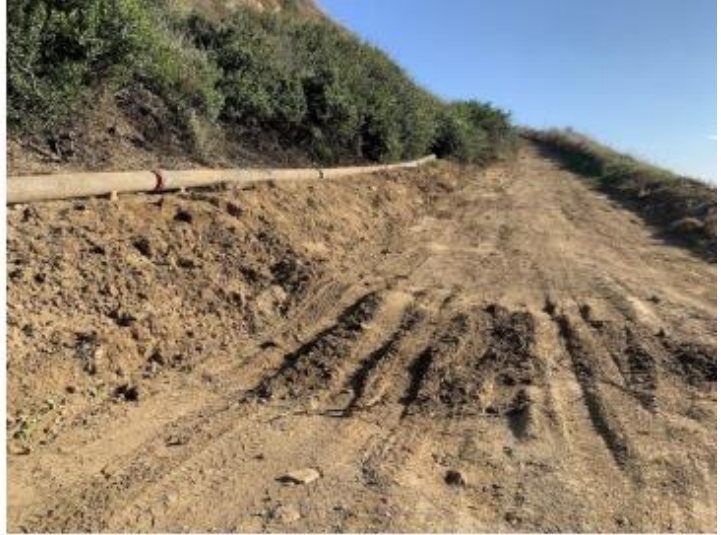
Before and after pictures of Burma Road Trail.

Park Rangers trimmed overgrowth along the Burma Road Trailhead on September 8.