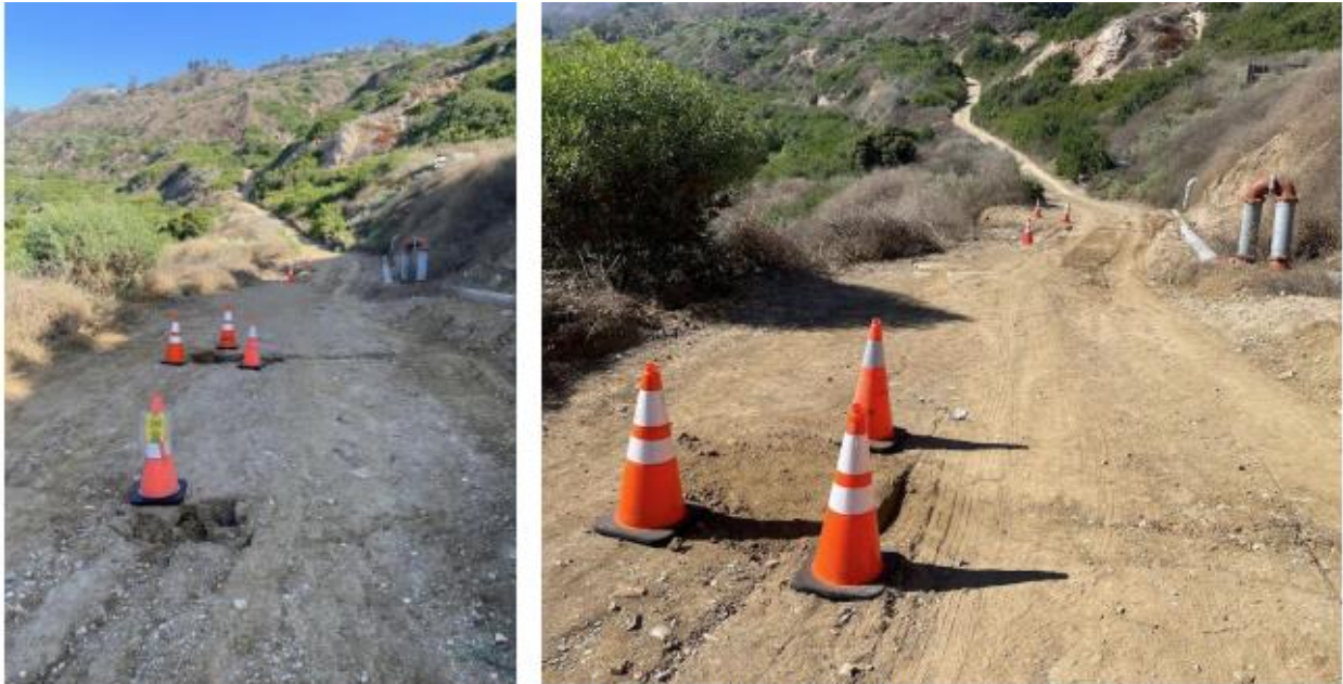
Before picture (left) was taken on August 25 with cones placed around the opened fissures compared to the picture after repairs (right) taken on August 28.

Park Rangers continued to make repairs to fissures that open up along Burma Road Trail. One such instance is notable on the lower section of Rim Trail and Burma Road Trail. One of the holes was measured to be at least 6 feet deep. With the assistance of contractors, the section was repaired.