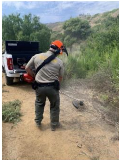
Park Ranger is performing trimming on Peppertree Trail.

On September 1, Park Rangers trimmed back overgrowth on the lower segment of Peppertree Trail.