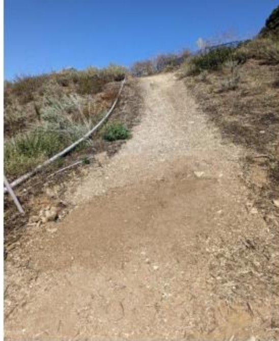
After picture showing smooth tread on Chapel View Trail.

On August 26, Staff trimmed back overgrown lemonade berry and made repairs to the tread of Beach School Trail.