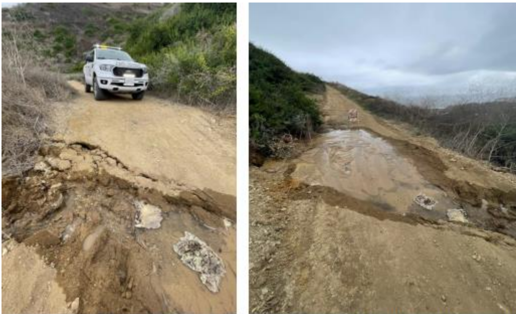
The water main break (left) and the damage on Burma Road Trail is depicted (right).

On September 5, Park Rangers were notified by the public of a water main break on Burma Road Trail. Rangers confirmed the leak was near Barn Owl Trail junction and temporarily closed a portion of Burma Road Trail, and Barn Owl Trail through September 7. CalWater was notified. The trail was reopened on the 8 after repairs were completed.