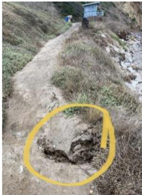
Before picture of Olmsted Trail.

On September 2, Staff repaired erosion on the tread of Olmsted Trail.