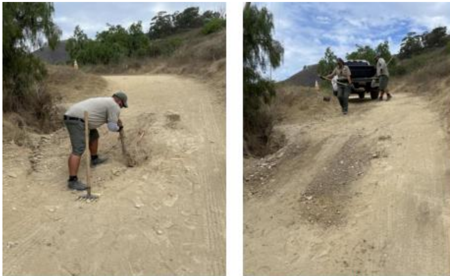
Before / After repairs of Burma Road Trail

On August 9, Staff repaired the tread on Burma Road Trail. This section continues to move due to land movement. Staff brought rock and dirt to fill in and compact the dirt to reduce the grade for vehicles.