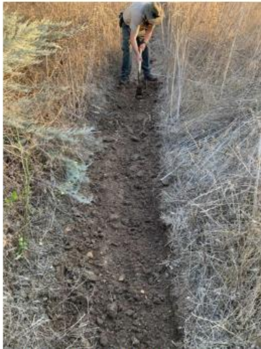
Before / After repairs of two sections of Panorama Trail.