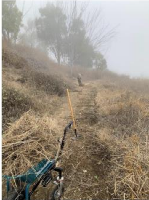
Wheelbarrow seen filled with trimmings gathered on Eagle's Nest Trail.

On August 24, Park Rangers resumed work on Eagle's Nest Trail to clear overgrowth trimmed back by contractors earlier in the month. The majority of the trimmings cleared were non-native mustard and tocalote.