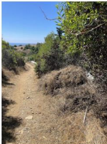
Staging area on Peppertree Trail.

On August 25, Staff began work on the upper section of Peppertree Trail to clear overgrowth trimmed back by contractors earlier in the month. Most trimmings cleared were non-native mustard and tocalote. Several piles were staged on the trail and were cleared within the week.