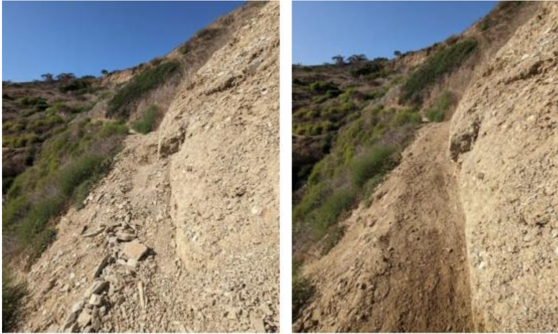
Before / after pictures of Cliffside Trail.

Cliffside Trail sustained some damage from the recent rain. The trail was briefly closed on August 25 to make repairs.