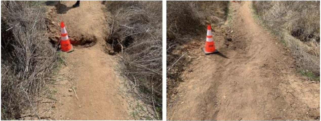
Before and after picture of fissure located on Klondike Canyon Trail.

On September 4, Park Rangers placed cones to advise the public of land movement on Klondike Canyon Trail. Additionally, some areas were repaired.