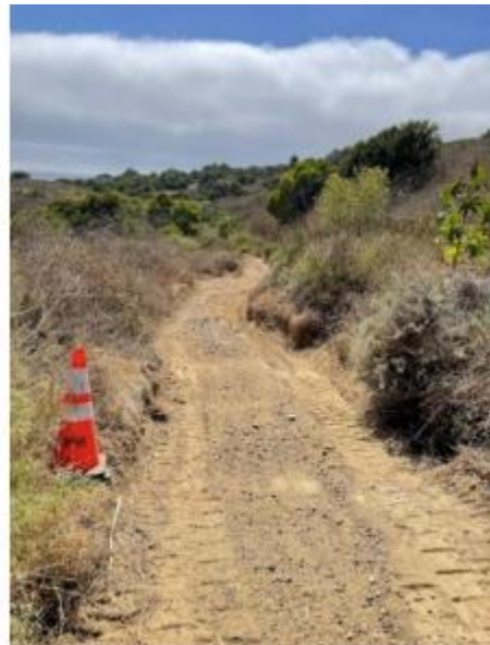
Before / After repairs of trail looking toward Ishibashi Farm Trail