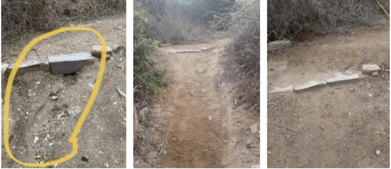
Before (left) and after (center and right) picture of the uppermost rock steps on Sea Dahlia Trail.

On September 2, Staff repaired erosion on the tread of Olmsted Trail.