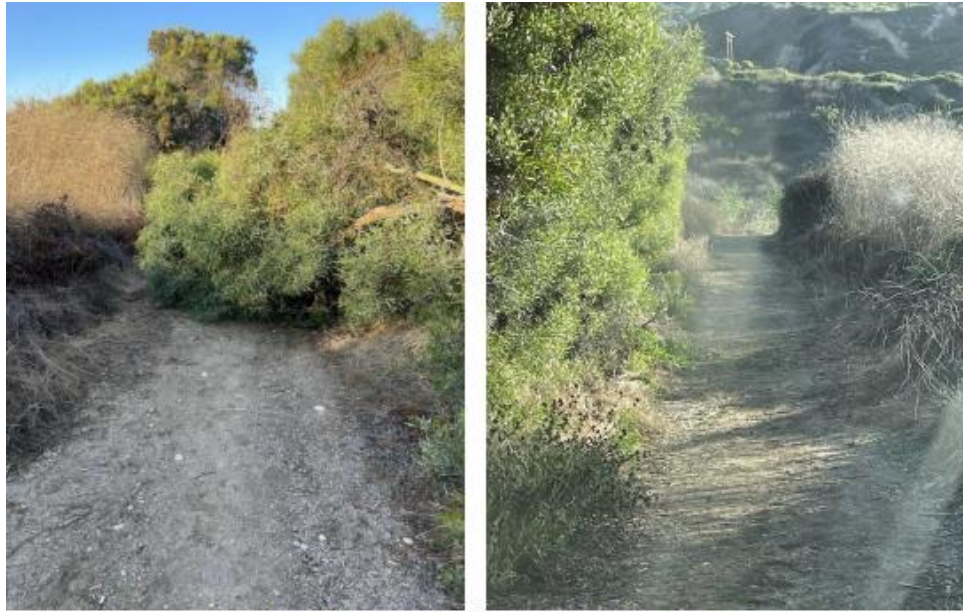
Before / after tree was cleared on Ishibashi Farm Trail.

On August 27, Park Rangers found an Acacia tree that had fallen on Ishibashi Farm Trail. The tree was cut back and removed, allowing through access on the trail.