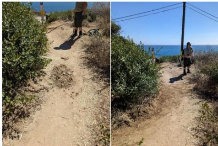
Before / after pictures of Beach School Trail.

On August 26, Staff trimmed back overgrown lemonade berry and made repairs to the tread of Beach School Trail.