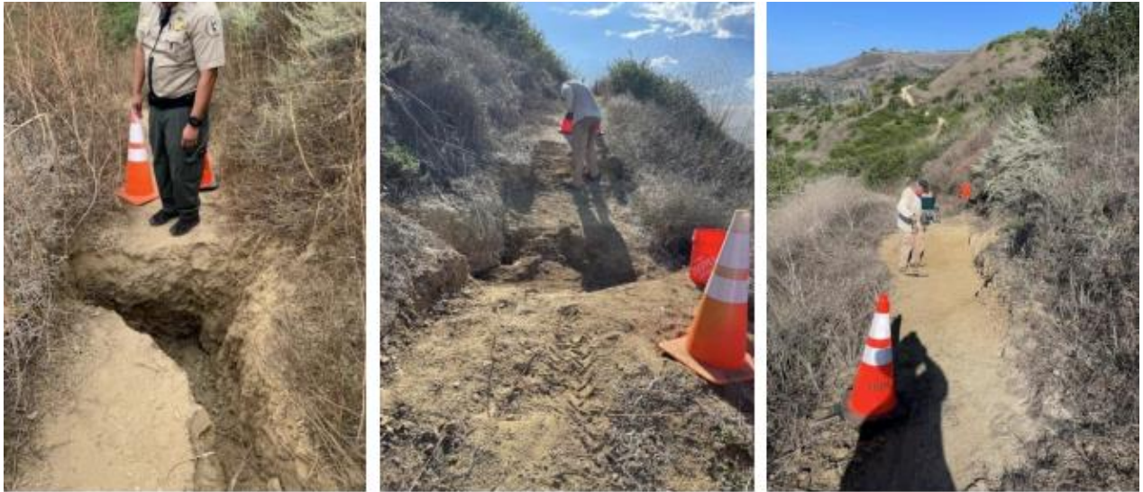
Before, during, and after photos of Ishibashi Trail repair project.

repaired on September 9 with the assistance of PVPLC Volunteer Trail Crew. Staff assisted in staging piles of dirt to use to fill in the fissure and repair the tread.