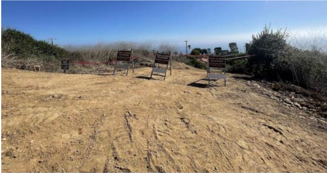
Three Trail Closed A-frames remain on Conqueror Trail.

On August 23, City Staff were notified of a fallen willow tree on Mariposa Trail. Staff was able to trim back part of the tree that was blocking access. On September 12, Park Rangers met with an arborist to determine the health and safety of the tree and coordinate next steps.