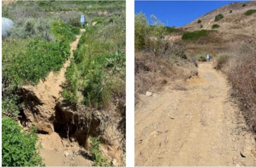
Before / After repairs of trail looking toward Sandbox Trail

On August 18, Cal Water repaired a section of Burma Road Trail near Rim Trail junction to ensure maintenance of their existing infrastructure. No trail closures took place.