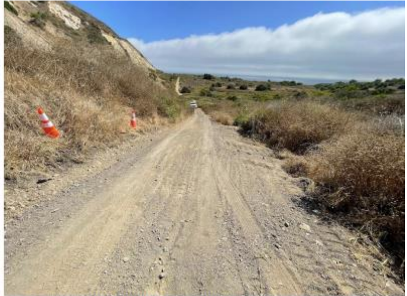
Before / After repairs of Peppertree Trail looking down toward Palos Verdes Drive South

Adjacent to the Reserve, this unnamed trail was also repaired by contractors on August 14 and is now reopened. The trail had also sustained damage due to severe rutting caused by significant rain events over the course of January – March 2023.