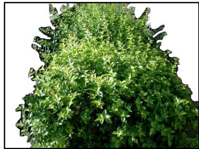
XYLOSMA CONGESTUM 'COMPACTA'