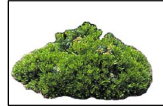
PITTOSPORUM TOBIRA 'WHEELER' DWARF MOCK ORANGE