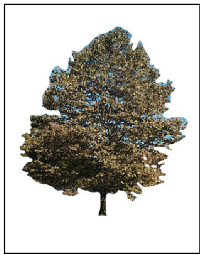
PLATANUS X ACERIFOLIA LONDON PLANE TREE