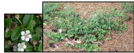
COTONEASTER DAMMERI 'LOWFAST' PROSTRATE COTONEASTER