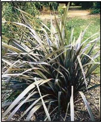
PHROMIUM TENAX 'JACK SPRATT' DWARF FLAX