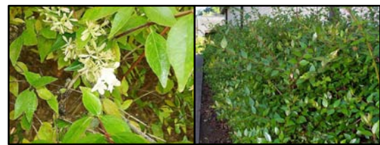
ABELIA GRANDIFLORA GLOSSY ABELIA