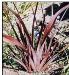
PHROMIUM TENAX 'DUSKY CHIEF' NEW ZEALAND FLAX