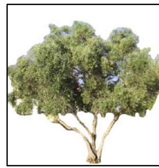
OLEA EUROPEA 'SWAN HILL' OLIVE