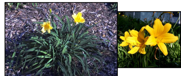
HEMEROCALLIS HYBRIDA 'YELLOW' YELLOW DAYLILY