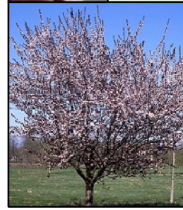
PRUNUS C. 'MOUNT SAINT HELENS' PURPLE LEAF PLUM