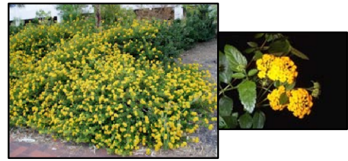
LANTANA MONTEVIDENSIS SPREADING LANTANA