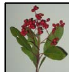
HETEROMELES ARBUTIFOLIA TOYON