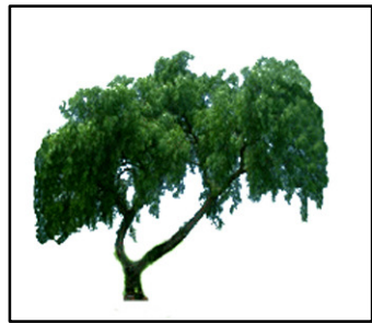
SCHINUS MOLLE CALIFORNIA PEPPER TREE