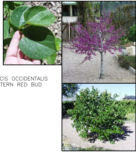
CERCIS OCCIDENTALIS WESTERN RED BUD