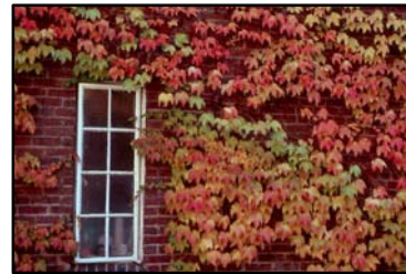
PARTHENOCISSUS TRICUSPIDATA BOSTON IVY