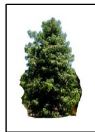
PODOCARPUS HENKELII LONGLEAF YELLOW WOOD (COLUMN)