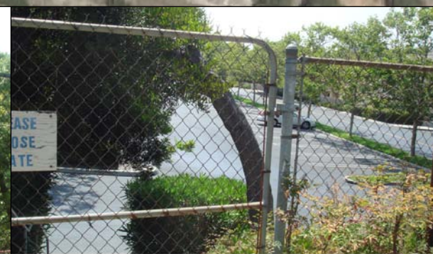
WEST VIEW OF SITE FROM RETREAT CENTER