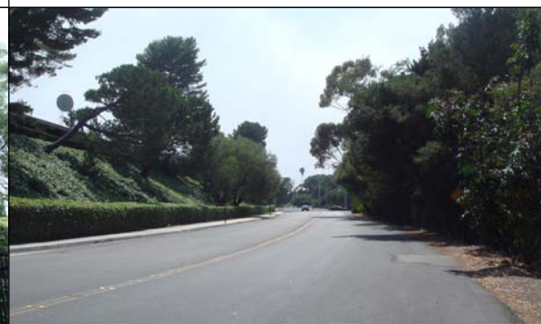
APPROACH TO SITE FROM EAST VIA CREST ROAD