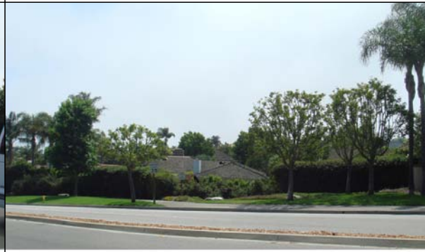
THE ISLAND VIEW COMMUNITY ACROSS CRENSHAW BLVD