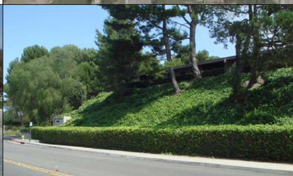
SOUTHEASTERN VIEW OF HILLSIDE ACROSS CREST ROAD