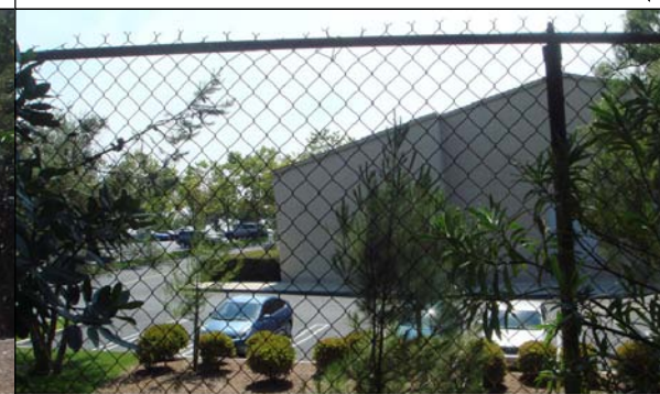
WEST VIEW OF BARRETT HALL FROM RETREAT CENTER