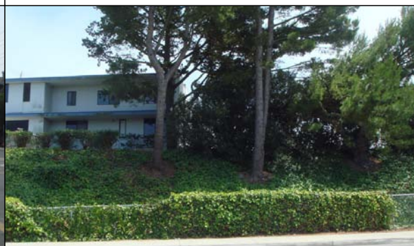
SOUTHERN VIEW OF HILLSIDE @ EXISTING RECTORY