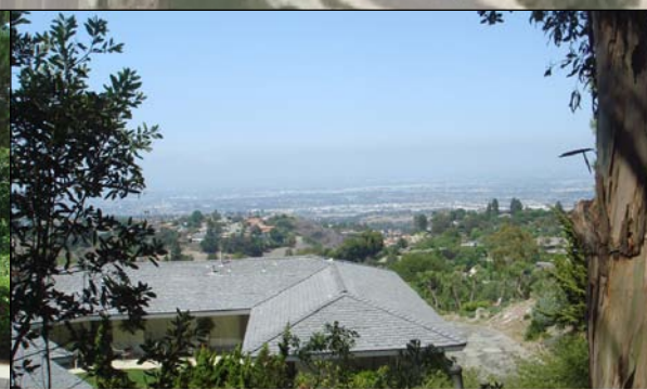
NORTH VIEW OF COMMUNITY ACROSS CREST ROAD