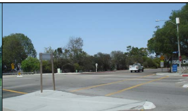
NORTHEAST VIEW OF CREST/CRENSHAW INTERSECTION