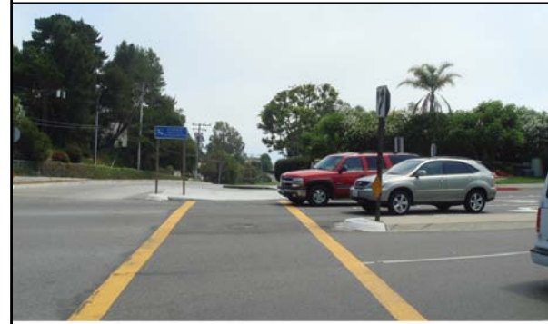
SOUTH VIEW OF CROSSWALK ACROSS CREST ROAD