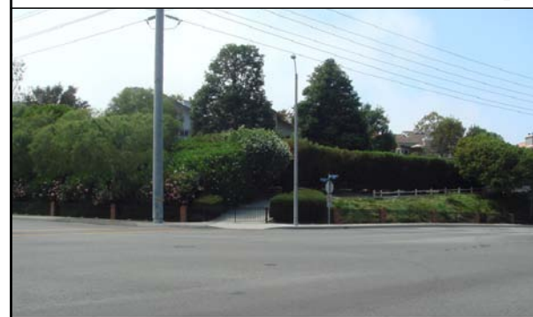
NORTHWEST VIEW OF CREST/CRENSHAW INTERSECTION