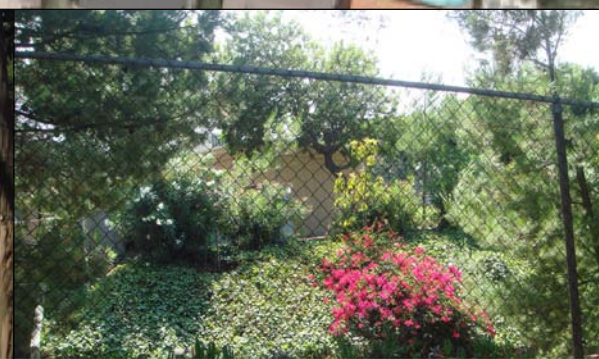
WEST VIEW OF SITE FROM RETREAT CENTER