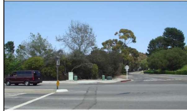
EAST VIEW OF CROSSWALK ACROSS CRENSHAW BLVD