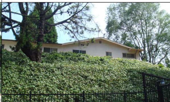
DAUGHTERS OF MARY AND JOSEPH RETREAT CENTER