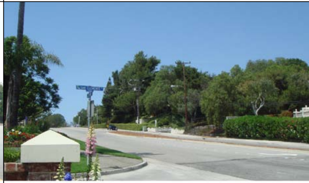
APPROACH TO SITE FROM SOUTH VIA CRENSHAW BLVD