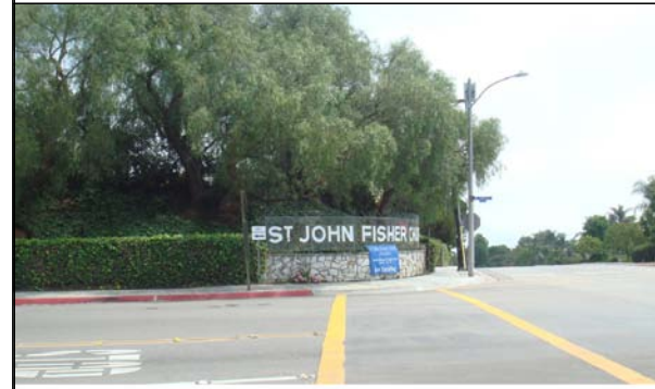
SOUTH VIEW OF CROSSWALK ACROSS CREST STREET