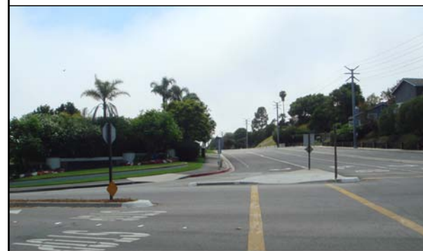
WEST VIEW OF CROSSWALK ACROSS CRENSHAW BLVD