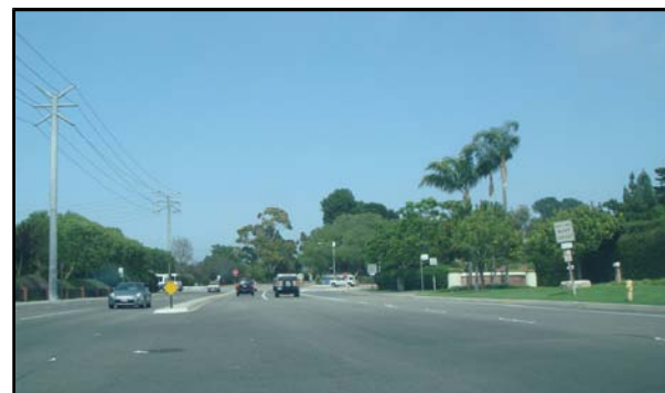
APPROACH TO SITE FROM WEST VIA CREST ROAD