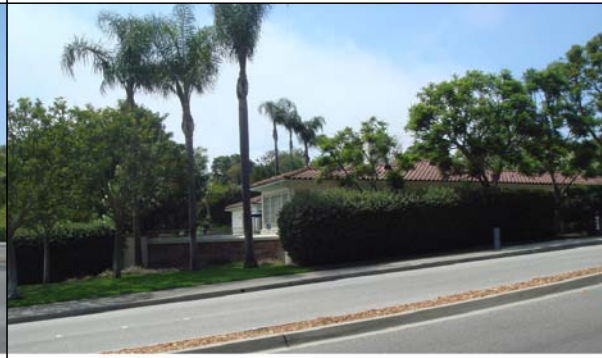
THE ISLAND VIEW COMMUNITY ACROSS CRENSHAW BLVD