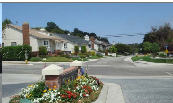
EAST VIEW OF COMMUNITY FROM THE ISLAND VIEW ENTRANCE