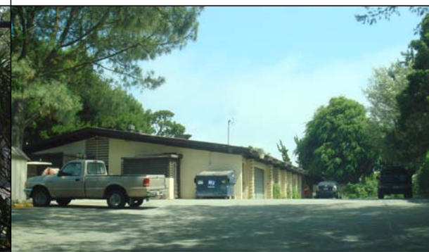
DAUGHTERS OF MARY AND JOSEPH RETREAT CENTER